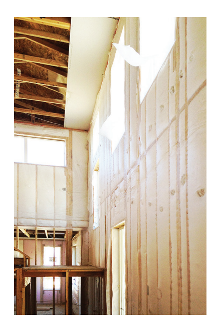
The 2x6, 24-inch on-center advanced-framed walls are stuffed with R-23 of blown-in fiberglass while an additional R-7.5 of rigid insulation wraps the exterior, providing a total wall insulation value of R-30.5.

Finally, the home is equipped with smart home technologies provided by Vivint that include a system for monitoring solar production and use, a smart thermostat, automated door locks, appliance and lighting controls, video surveillance, and an enhanced security system, which can provide two-way communication with emergency dispatchers in an emergency.