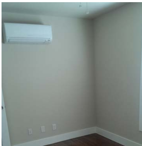
A high-performance ductless heat pump provides all of the home's heating and cooling.