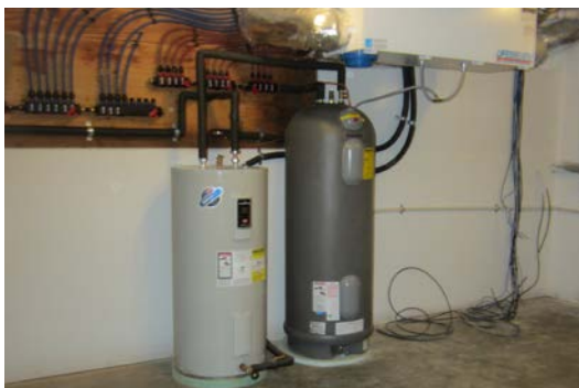
A high-efficiency ground-source heat pump provides space heating and cooling and preheats water for the electric tank water heater.

stays an even 50°F year round, ground-source heat pumps can achieve far greater efficiencies than an air-source heat pump. The 3-ton unit has a modulating condenser and variable speed electrically commutated fan motor for additional efficiency of the system, which has a coefficient of performance (COP) of 5.7 and an energy efficiency ratio (EER) of 44.0. It also has