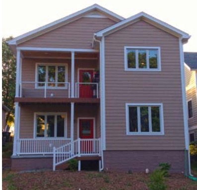
Triple-pane windows let in light while retaining heat.

design an HVAC layout that used two mini-split slim-duct units. These are similar in efficiency to ductless heat pumps, but are installed in a dropped ceiling or closet and have short duct runs to adjacent rooms. Each inside unit is tied to an outside compressor unit. The units are highly efficient, having a heating efficiency of 12.2 HSPF and a cooling efficiency of 21 SEER. The upstairs unit is installed in a closet above a dropped ceiling and has ducts into the family room and the kitchen. The downstairs unit is located in the utility room with duct runs going to registers in the three bedroom ceilings. Each heat pump has a central return grille with a 2-inch-thick MERV 11 filter. The 12-inch metal trunk ducts and 6- or 8-inch metal branch ducts are mastic-sealed with short (<5 feet) flex duct sections at the ends to connect to the registers to minimize sound and facilitate installation.