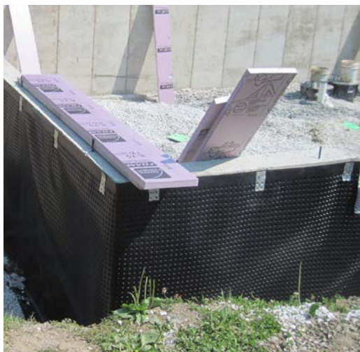
Dimpled plastic carries water away from the foundation wall and down to the footing drains.

exterior walls is run up to the top of the raised energy heel trusses to provide a seamless air barrier. There are no recessed can lights in the second-floor ceiling and all smoke detectors on the second floor were installed on interior partition walls instead of in the ceiling. Wall sconces were used where possible and, where ceiling fans or other ceiling-mounted lights were necessary, the metal electrical junction boxes were completely taped and then further sealed with one-part spray foam.