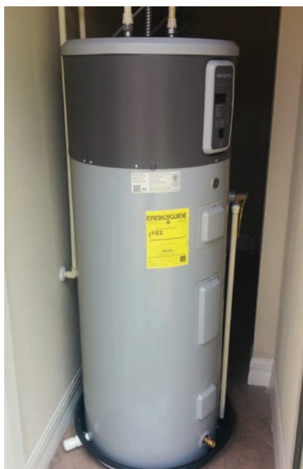
A heat pump water heater provides the home's domestic hot water.

to provide the finished flooring within the home. This hard, low-maintenance surface is easy to clean and impervious to water damage. The SIP roof panels provided insulated vaulted ceilings, which give the home a spacious feel despite the small footprint.