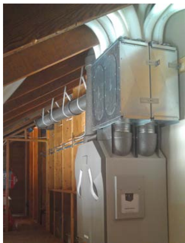
An HRV brings in fresh air.

for radiant floor heat. The concrete for the slab was reinforced with a product consisting of tiny pieces of twisted steel micro-rebar rather than standard rebar or wire mesh; the product is reported to distribute loads for less cracking. The floor assembly had a total insulation value of R-58 (when calculated with framing reduction).