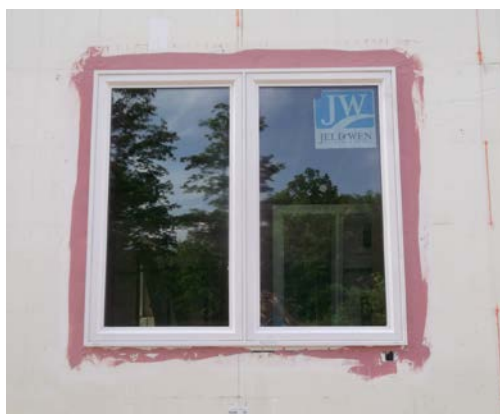
A liquid-applied flashing helps to keep water from seeping in around the triple-pane windows.

Aebi installed a 9.9-kW solar electric systems on the home, which helped the home achieve a Home Energy Rating System (HERS) score of -5 and cut annual utility costs from an expected $1,655 without the PV to $36 per year with the PV system installed.