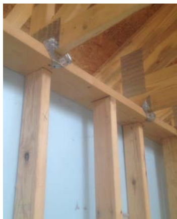
Staggered studs allow blown cellulose to wrap around the edges of the studs.

The affiliate selected highly insulated triple-pane windows with vinyl frames, plus low-emissivity coatings and an argon gas fill between the panes to minimize heat transfer.