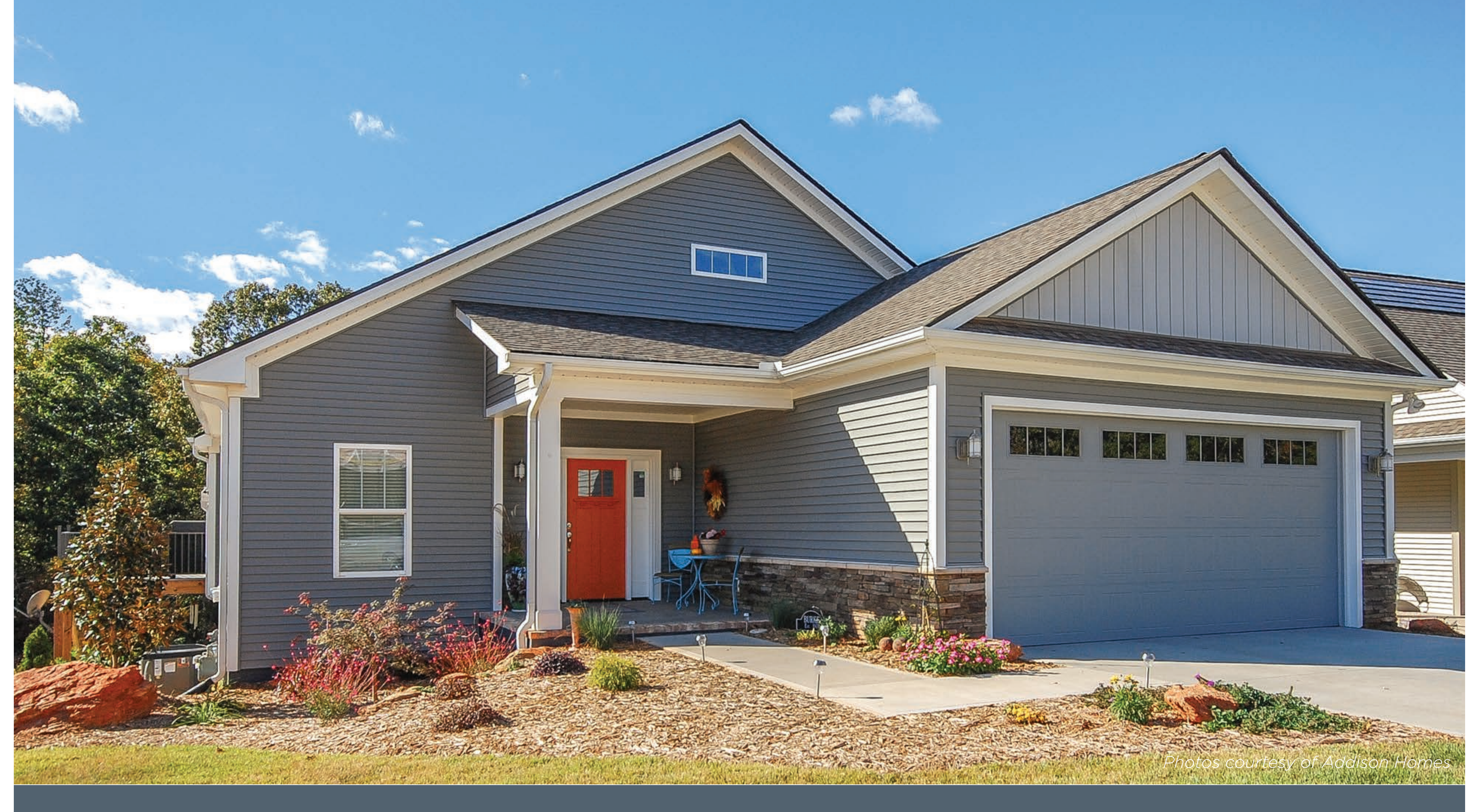
"We love this home. The energy bills are miniscule and the comfort is tremendous!" Home owner

Jocassee Plan | Greer, SC | Addison-Homes.com