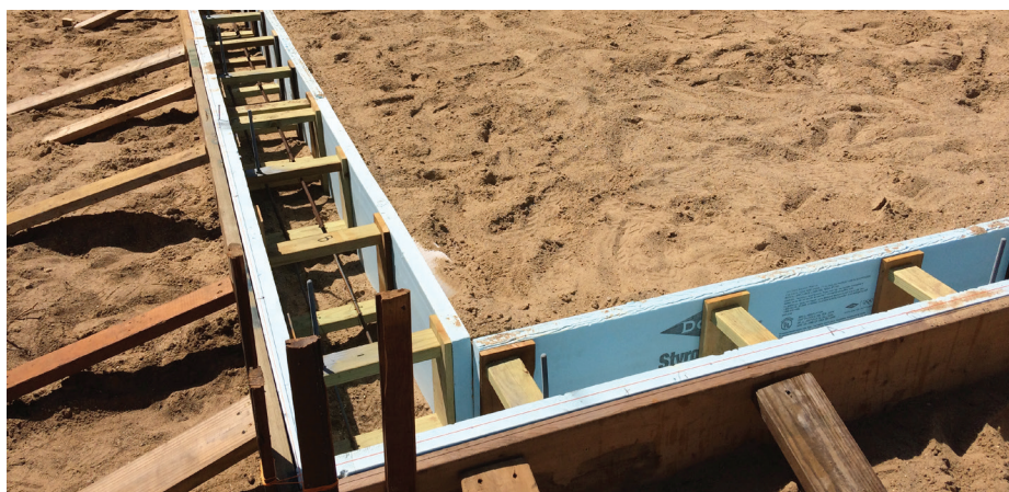
Do-it-yourself insulated concrete forms create the foundation walls.

Hot water is provided by a condensing tankless gas water heater with an efficiency of 98% AFUE. All of the hot water lines are insulated half-inch PEX tubes that come off a central manifold next to the water heater and go directly to their end uses. The home was designed to have all of the hot water fixtures clustered together for short runs and located, near the water heater, which is in a closet in the laundry room directly adjacent to the kitchen and bath. No lawn sprinkler system was installed.