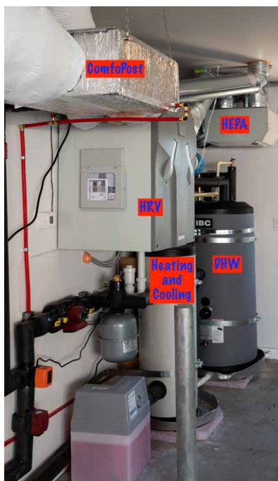
An air-to-water heat pump provides ultra-efficient heating and cooling.

air is brought in through the HEPA filter. The incoming air is tempered through the heat exchanger on the HRV to minimize blasts of cold or hot air from the incoming air.