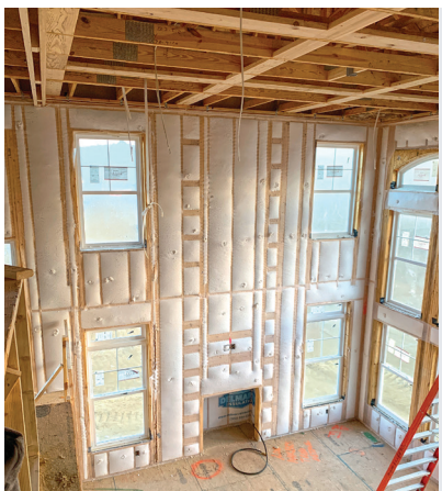
Advanced framing allows more room for blown fiberglass insulation in the 2x6 at 24-inch on-center framed walls.

Given the longer shoulder seasons in the mixed-humid climate, space conditioning demands for sensible load may be minimal. Coupled with the high-performance windows, 6-inch exterior walls, and larger overhangs, the heating and cooling load is significantly reduced for a home of this size. With the space conditioning system not calling for heating or cooling, the homes are designed to have the central air handler fan (with an ECM motor) run in manual mode at 30% fan capacity for a minimum of 45 minutes every hour. Ceiling fans are installed in the central living spaces, including the living room, loft, morning room, and master bedroom. The periodic cycling of