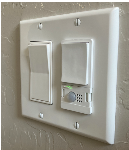
Light switches incorporate motion detectors and indoor air quality sensors.

The unvented attics and vaulted ceilings are insulated on the underside of the plywood roof deck with 8 to 10 inches of open-cell spray foam for an insulation value of R-33. The roof is topped with ENERGY STAR Cool Roof certified asphalt shingles. The exterior walls consist of 2x6 laminated strand lumber studs spaced 16 inches on center. The stud walls incorporate advanced framing techniques like three-stud insulated corners, open and insulated headers, and ladder blocking at interior wall intersections to increase the amount of space in the walls for insulation. The wall cavities are filled with open-cell spray foam in the cavities then wrapped with taped house wrap and covered with a continuous 0.5-inch-thick layer of rigid XPS foam for an R-25 total wall insulation value. The walls are covered with stucco cladding.