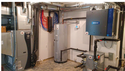
A ground-source heat pump provides both space and water heating.

Hot water for the all-electric home is provided by the water-to-water ground-source heat pump with an 80-gallon storage water tank to provide 100% of the domestic hot water for the home. The storage tank is fitted with an electrical element for emergency back-up only, should the heat pump fail (e.g., due to an electrical surge).